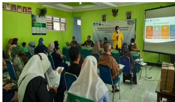
Figure 1. Presentation by MSME Product Digitalization Speaker.

online applications for purchasing various products. Digitalization has become an integral part of everyday life for the wider population and is inevitable. It also serves as a solution for the vast number of MSME entrepreneurs in Indonesia. In Tonjong Village, where a significant portion of the community's livelihoods is derived from small and medium-sized enterprises (MSMEs), the introduction of digitalization for MSME products has been met with enthusiasm. The residents of Tonjong Village (refer to Figures 1 and 2) have displayed a high level of enthusiasm and engagement while participating in these activities, signifying its importance and relevance.