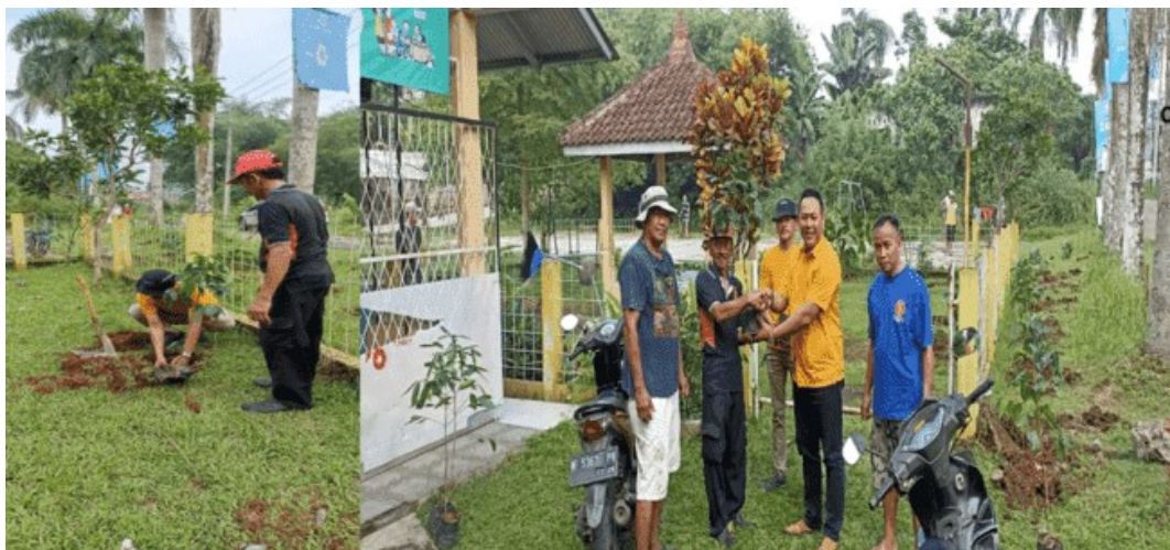
Figure 8. Coffee Plantation in Tonjong Village