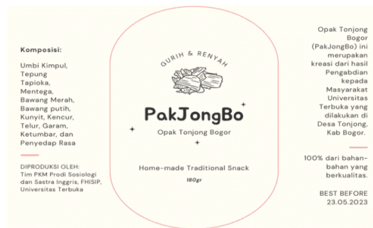
Figure 5. "PakJongBo" Opak Product Labels, Unique to Tonjong Village

In addition to providing information on digital marketing of MSME products and practical demonstrations of opak processing with various flavors, the Abdimas team has made several other contributions to the community of Tonjong Village: