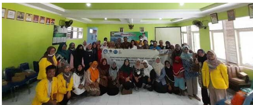
Figure 2. Participants in the MSME Product Marketing Digitalization Event.

After comprehending the information presented by the speaker during the MSME product marketing digitalization event, the residents of Tonjong Village who participated in the activity expressed their understanding and strong interest in utilizing e-commerce as an effective means of supporting MSME businesses in their village. They recognized numerous advantages, such as.