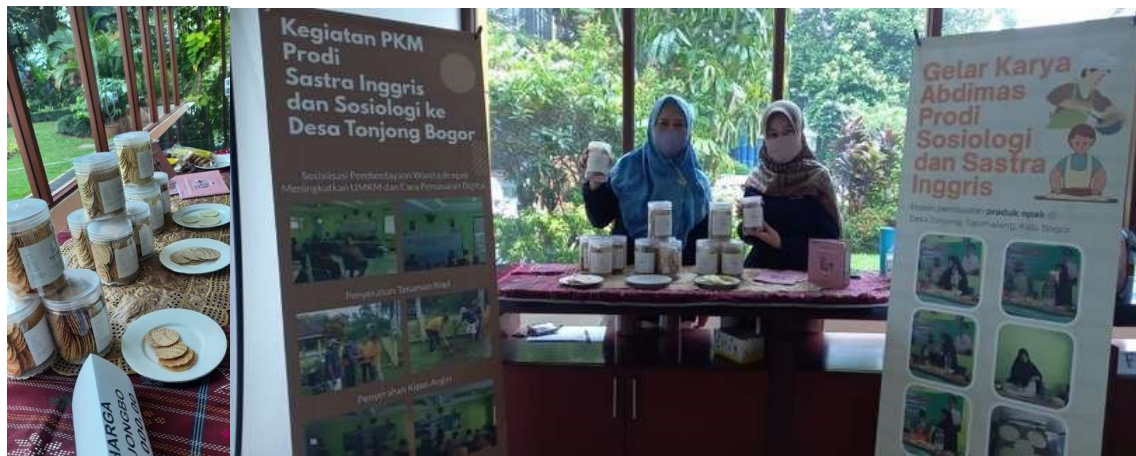
Figure 4. Results of the Practice in Producing Opak with Various Flavors.

faced when producing opak-based MSME products. This initiative has resulted in a range of new flavors (see Figure 4).