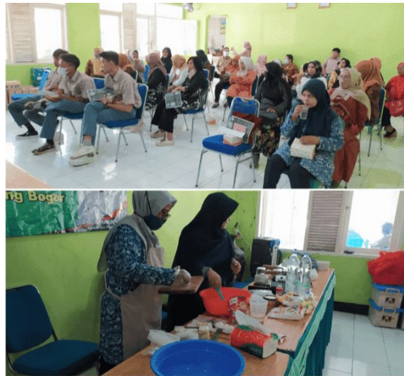
Figure 3. Participants in the Demonstration of Opak Processing with Various Flavors.

The opak artisans in Tonjong Village have received substantial support from the village government. One of the forms of support is the practice of opak production, evident through workshops and awareness campaigns organized by the village government. Additionally, the enthusiasm of the community (refer to Figure 3) plays a vital role in empowering the community through opak-based MSMEs, as it contributes to increasing their income.