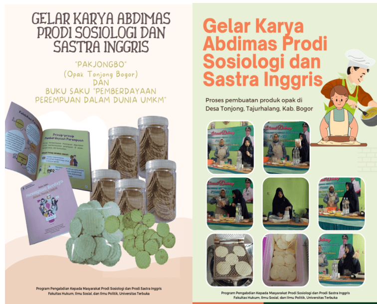
Figure 7. Banners and Standing Banners for the Abdimas Activity Implementation