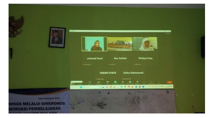
Figure 2 Hybrid training process

In the realm of modern education, where technology and tradition intertwine, SMP Wahid Hasyim stands as a beacon of progressive pedagogy. In response to the evolving educational landscape, the institution takes a bold stride by introducing a paradigm that marries the richness of face-to-face instruction with the potential of online learning. This initiative, known as hybrid training, is not merely a novel concept; it represents a comprehensive strategy to enhance the academic journey of students (Thaariq et al., 2020).