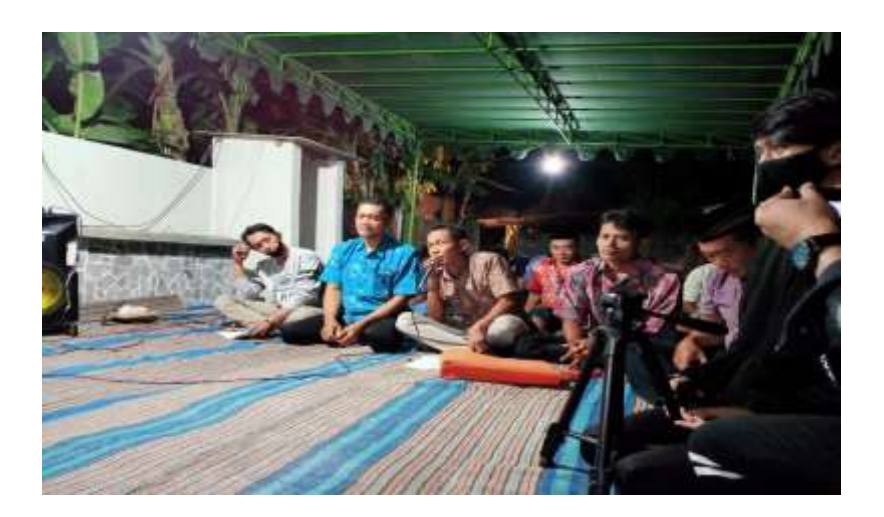
Figure 4. Sharing evaluation results of PKM Implementation

"that initially, the business management carried out so far has already been referencing the Triple Bottomline. Despite this, the implementations were not carried out continuously, such as in the use of natural dyes where the batik waste management process would sort out hazardous wastes or not".