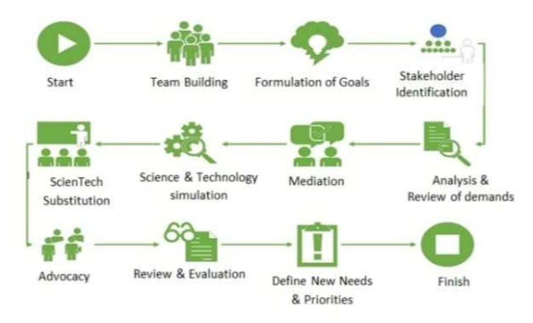
Figure 2. Implementation Method Diagram

This section describes the methods used to solve the problems. Based on observations, the appropriate implementation method of this community service is through the following: (as in Figure 2)