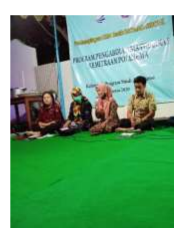
Figure 3. Socialization of Batman Ribone SOP

The method of implementation for this PkM activity uses a participatory method approach which provides instructions on the use of Batman Ribone SOP. The activity is in the form of mentoring and is intended for the improvement of participants' governance of organizational management, entrepreneurial motivation, and business planning proposals (business plan). Figure 3 illustrates the socialization of SOP event.