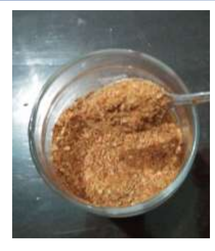
Figure 3 . Products from the processing of tomato and cayenne chili (a) tomato sauce and (b) cayenne chili powder.