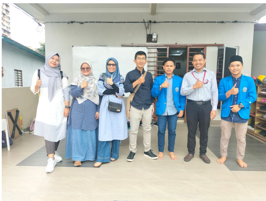
Fig 3. Visit to SB Sentul

The third activity is a field visit to SIKL and SB on Friday, September 23, 2023. The visited Guidance Studios are Sentul Guidance Studio, Sungai Mulia 5 Gombak KL Guidance Studio, and PPWNI Klang. The results of the visit to SIKL involve coordination and preparation of training activities. Through visits to the three Guidance Studios, the team can directly observe learning, interact with teachers and students. Learning there still employs lecture methods and does not use enjoyable methods. Therefore, the solution to this problem is through training conducted in the fourth activity.